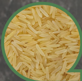
1509 GOLDEN SELLA