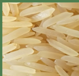
1401 GOLDEN SELLA