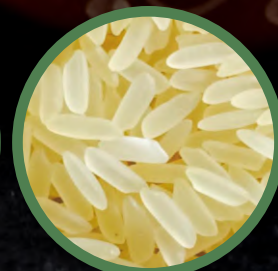
PARMAL GOLDEN SELLA RICE