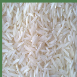
SUGANDHA RAW RICE