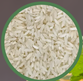
SONA MASOORI RAW BASMATI