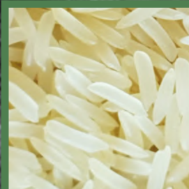
SHARBATI GOLDEN SELLA RICE