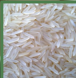
SHARBATI RAW RICE