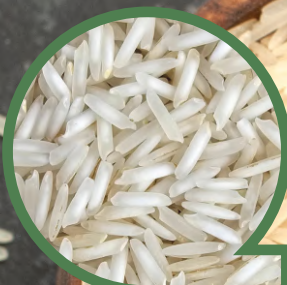
1509 RAW RICE