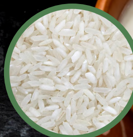
PARMAL RAW RICE