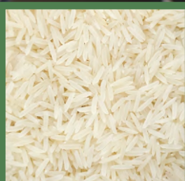
1401 SELLA BASMATI