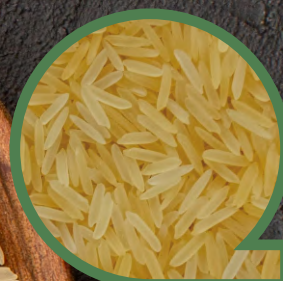
1121 Golden Basmati Rice