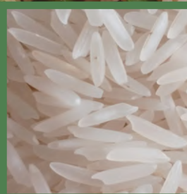
PUSA RAW BASMATI