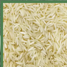
SHARBATI STEAM RICE