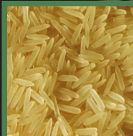
PUSA GOLDEN SELLA