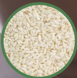
Jeerakasala / Gobind bogh Rice