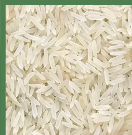
SHARBATI SELLA RICE