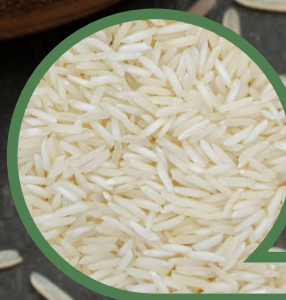
TRADITIONAL RAW RICE