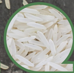
TRADITIONAL SELLA RICE