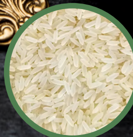
PARMAL SELLA RICE