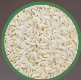
SONA MASOORI STEAM RICE