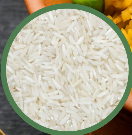
PR 11/14 RAW RICE