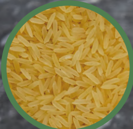
PR 11/14 GOLDEN SELLA