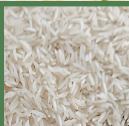
1401 RAW RICE