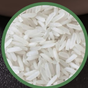
IR 64 Raw rice