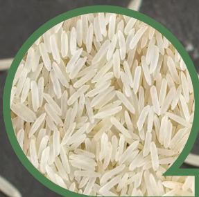
1509 SELLA Basmati Rice