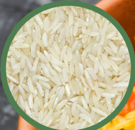
PR 11/14 STEAM BASMATI