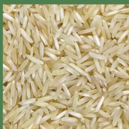
SUGANDHA STEAM RICE