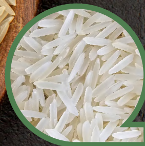
1121 Sella Basmati Rice