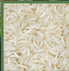
PUSA STEAM BASMATI