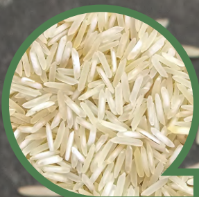
1509 STEAM Basmati Rice