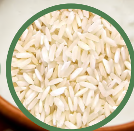
PARMAL STEAM RICE