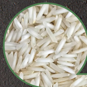
1121 Raw Basmati Rice