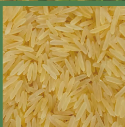
SUGANDHA GOLDEN SELLA