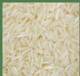
1401 STEAM BASMATI