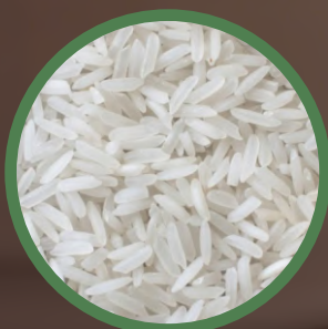
IR 64 parboiled rice