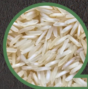
1121 Steamed Basmati Rice