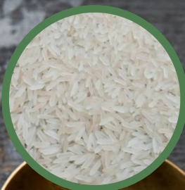
PR 11/14 SELLA BASMATI