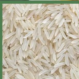
SUGANDHA SELLA RICE